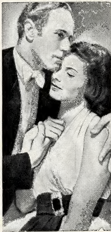
Mat 1A LESLIE HOWARD and INGRID BERGMAN co-star in David O. Selznick's "INTERMEZZO," being re-released by Eagle Lion Films starting . . . at the . . . Theatre.

"Intermezzo" also benefited from the sensitive direction of Gregory Ratoff and the performances of a supporting cast which includes Edna Best, John Halliday and Cecil Kellaway.